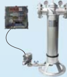
High precision filter Cartridges